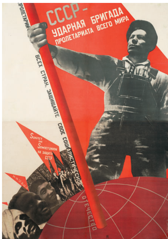
Gustav Klutsis, “The USSR is the Stakanovite brigade of the world’s proletariat,” 1931, lithograph. From Views and Re-Views.

In June of 1973, Northwestern bestowed an honorary degree upon famed Russian composer Dmitri Shostakovich. Organized by the Northwestern Music Library and University Archives, the exhibition “Dmitri Shostakovich at Northwestern,” running September 20 to March 19, recalls Shostakovich’s visit to campus through original documents and materials, including rare Shostakovich scores published in the Soviet Union.