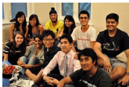
The Global Engagement Committee of the International Student Association.

Food for Thought (FFT) , recently launched by the Global Engagement Committee of the International Students Association, is a series of dinners where international students can present prevalent issues from their home countries to attendees. FFT brings together diverse opinions on international current events as well as ageless issues, while stimulating the minds of its participants with free ethnic food to match the discussion topic. Food For Thought strives to promote friendly intercultural exchange by bringing together both international and American students to debate topics that range from the merits and downfalls of foreign aid to the Fukushima natural and nuclear disaster. These monthly discussions have enabled earthquake victims, political refugees, and others with personal experience to share their insight in a reflective and respectful environment. This year's first topic will cover renewable energy in developing countries.