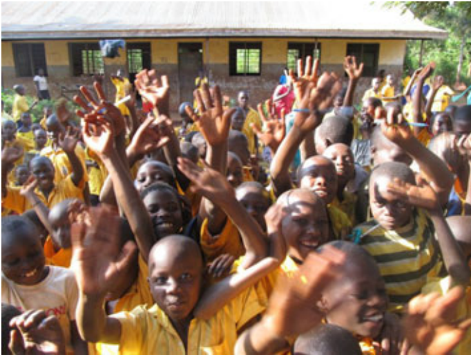
Children at St. Eliza's, an NGO GESI students worked at in Jinja, Uganda.