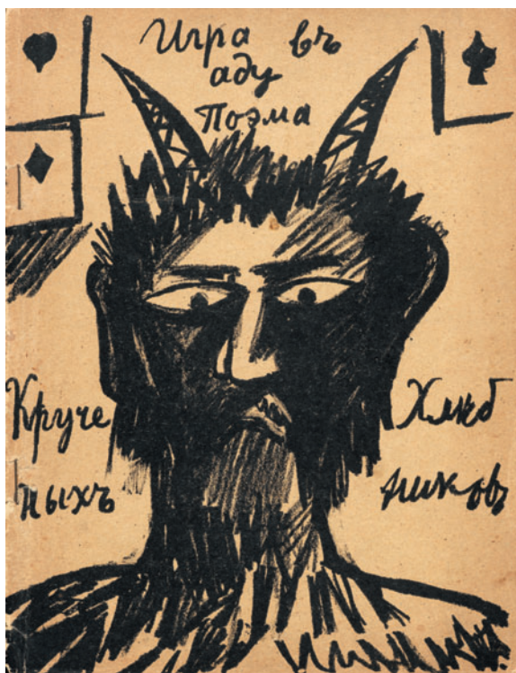
Velimir Khlebnikov, poetry, Natalia Goncharova, art, and Alexei Kruchenykh, poetry, A Game in Hell Poem, 1912 , lithograph. The Getty Research Institute, Los Angeles, California (88-B25686). From Tango with Cows .

These exhibitions and programs are part of The Soviet Arts Experience, a 16-month-long, Chicago-wide showcase of works by artists who created under (and in response to) the Politburo of the Soviet Union. Visit www.SovietArtsExperience.org for a full schedule of events. ♦