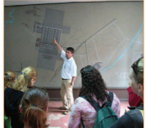
Students receive a lecture at the Auschwitz and Birkenau concentration camps as part of the Jewish and Polish interactions course taught in Krakow, Poland.

grams include housing, breakfast, excursions and two courses and cost $6,000 each. More info can be found at: http://www.northwestern.edu/studyabroad/summerstudy/index.html or by contacting Rita Koryan r-koryan@northwestern.edu ■